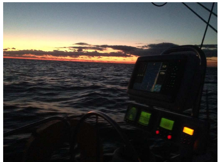
Sunrise on the Atlantic from Verre de Mer's helm. Obviously, it's hard to get photos at night, especially given how dark it gets offshore!

Let me take a minute to describe that night. Rounding Cape Hatteras, we had been getting pushed by a steady wind at 15 knots. By the next point of land, Lookout Bight, a Small Craft Warning had been issued by the Coast Guard. As the wind continued to build about 1:00 a.m., the crew on deck decided it was time to put a reef in the main. As every sailor knows, it was now well past time to think about putting a reef in, but that's