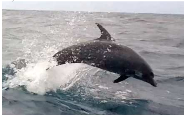
One of the members of the pod of "escorts" we thoroughly enjoyed during our last day at sea.

I finished my shift without incident. For me, this was the most intense watch of