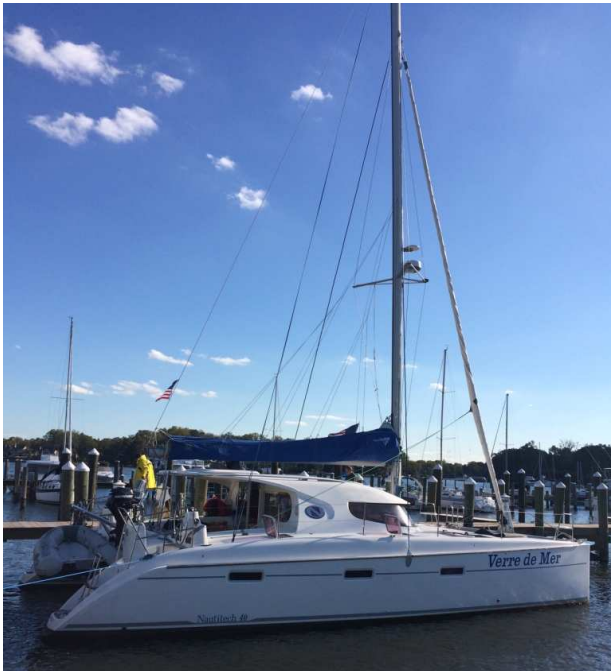
The vessel we were delivering: A 2006 Nautitech Catamaran called Verre de Mer, seen here in her temporary slip in Edgewater, MD the day prior to our departure.