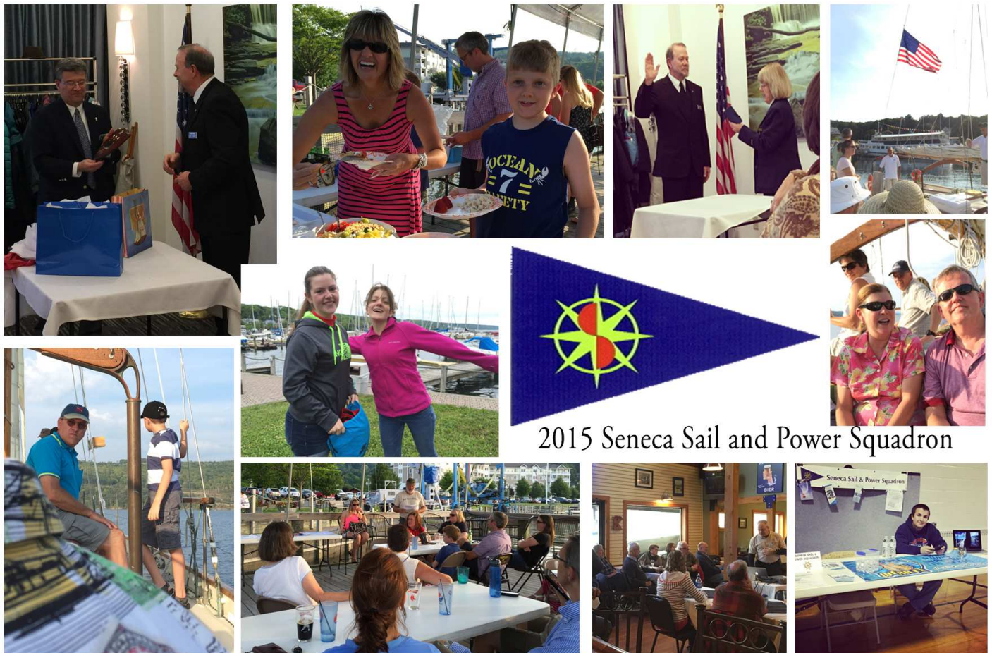
2015 Seneca Sail and Power Squadron